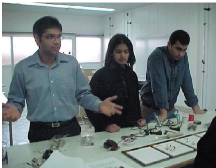
engineering lab of Effat College.

Duke's Pratt School of Engineering became Effat College's esteemed partner in program development when an agreement was signed in January 2005 to collaborate on the development of the first undergraduate degree in Engineering for women in Saudi Arabia. The initial stage involved the